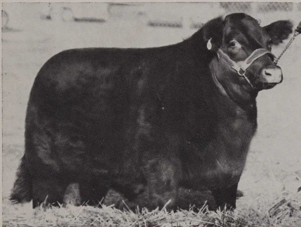
Champion Shorthorn, Open Class, Southwestern Livestock Exposition, Ft. Worth, Texas, 1959. Sired by our Herd Bull and came from our herd.

WARREN COUNTY SALE BARN, INDIANOLA, IOWA 12:30 P. M.